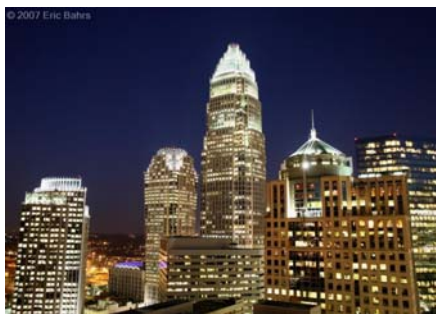
Skyline of Charlotte

Also, looking for reviewers for proposals! Please contact Kaleidoscope Chairs, if interested.